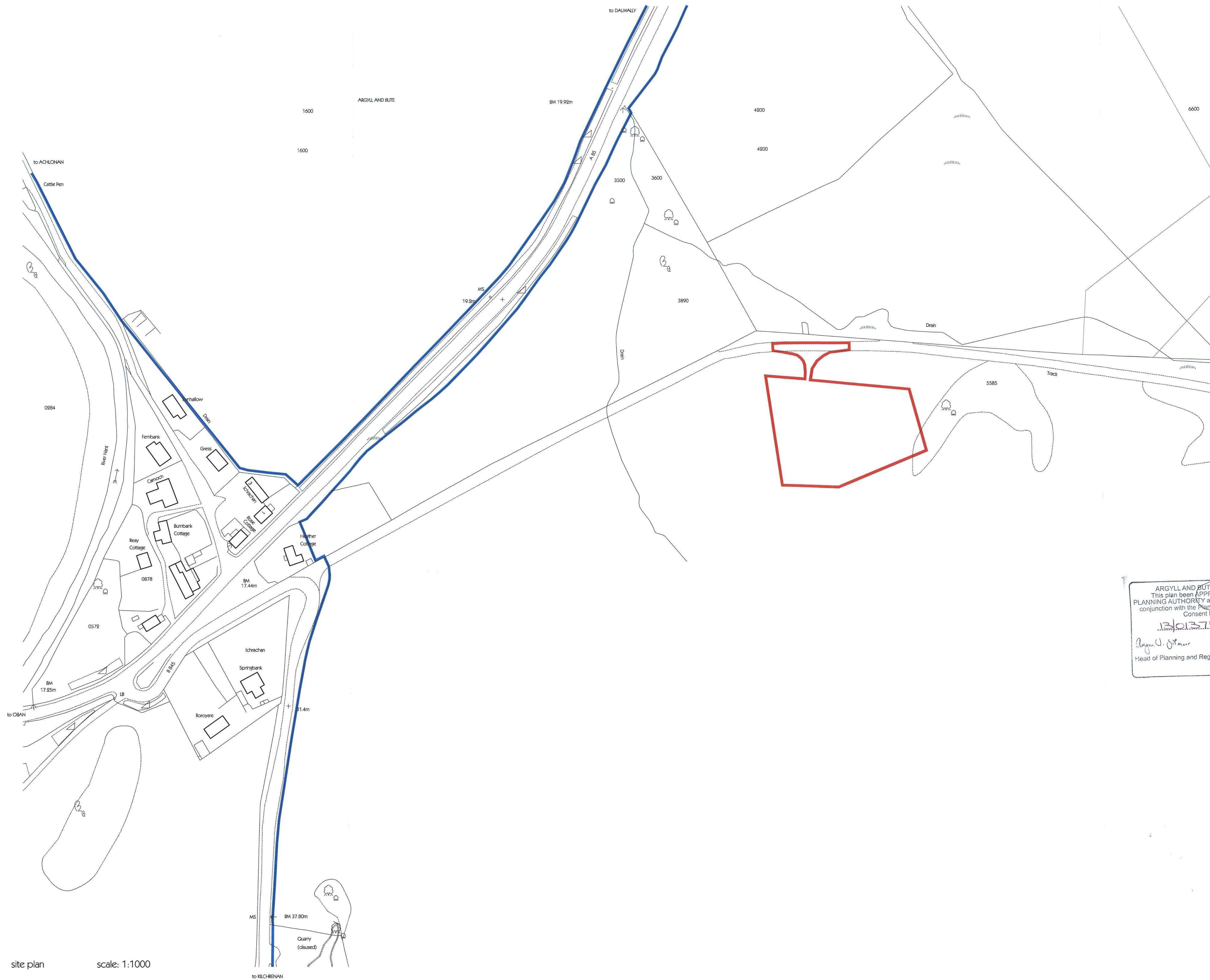
site plan scale: 1:1000